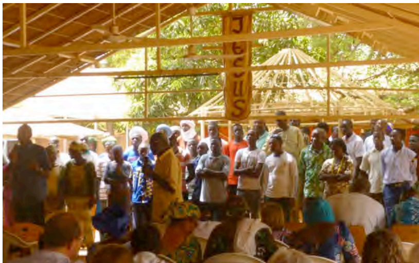
Worship service at the Hosanna Center in Niamey

The last Sunday in May, the young men of the church were encouraged to be good models and be bold for outreach in their communities.