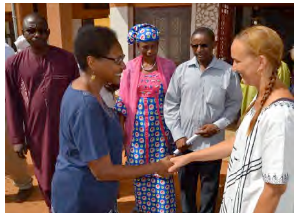
Family picture with the US Ambassador Eunice Reddick, special guests and local authorities